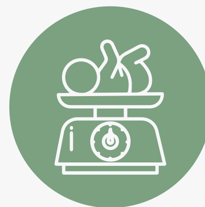
Food intolerances linked to reduced growth of the newborn baby